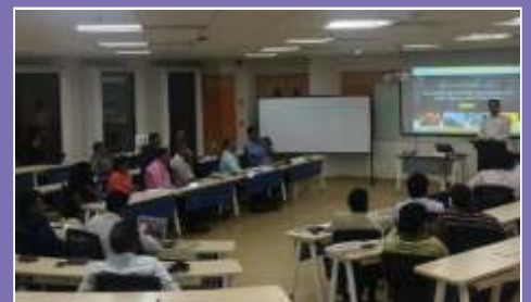
BUSINESS NETWORKING FORUM