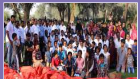
FAMILY GET TOGETHER - USA CHAPTER