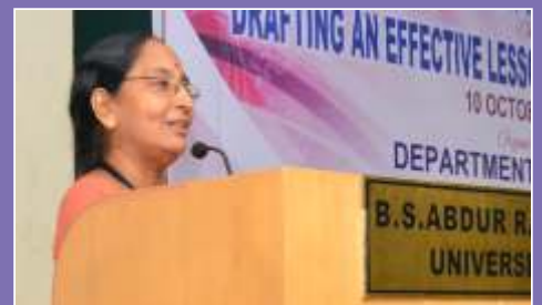
STAFF OF THE MONTH