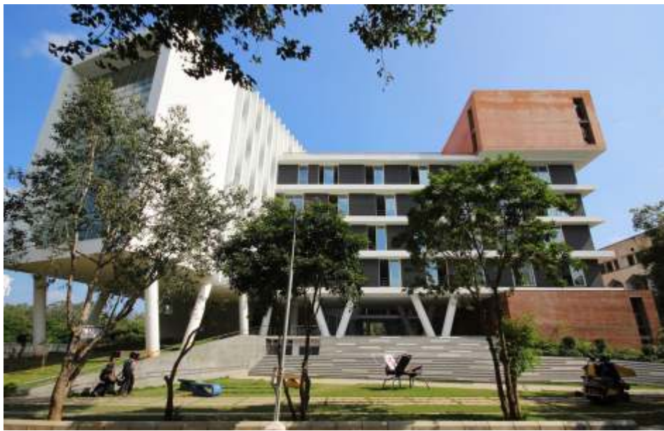
BSAU ALUMNI ASSOCIATION NEWSLETTER: ISSUE 7 - APRIL 2017